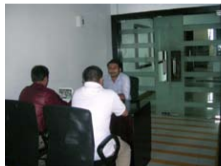
Exclusive Travel Desk has started functioning close to the Lobby. Now guests can get services of the Travel Desk round the clock.